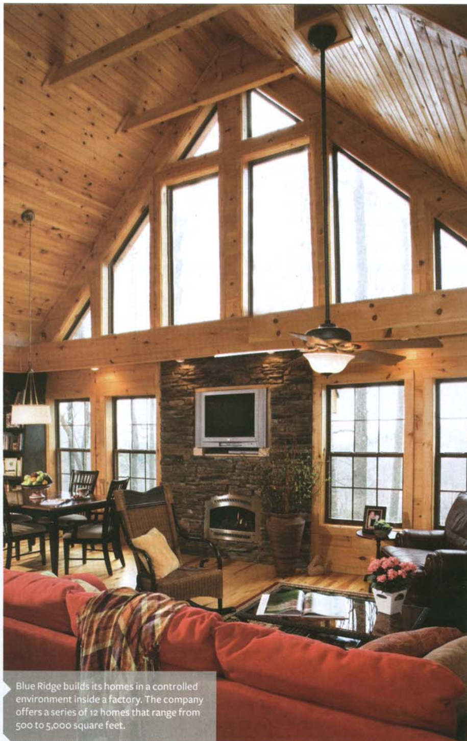
Blue Ridge builds its homes in a controlled environment inside a factory. The company offers a series of 12 homes that range from 500 to 5,000 square feet.

Blue Ridge offers a series of 12 homes that range from 500 to 5,000 square feet. The company uses eastern white pine for construction and constructs homes out of a solid-log style, not log siding. This means that the house is constructed out of whole logs and not framed with another building material with half logs placed on the outside of the home. "We are the only ones in the world who do this," Smith states.