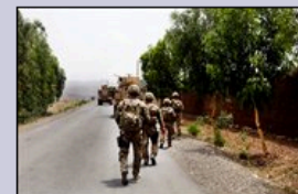
Soldiers Conduct Search Mission in Khost Province